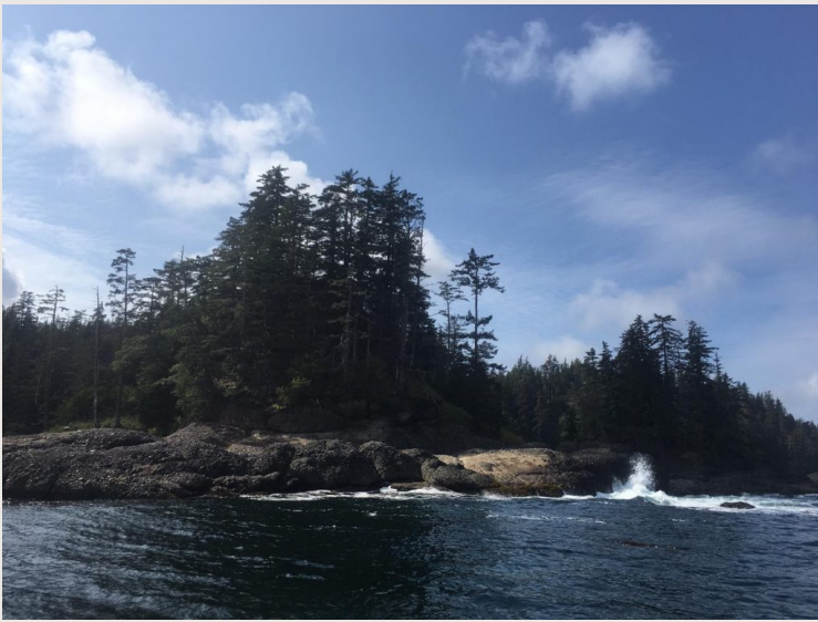
Waves crashing on the shore of Boulder Bay.