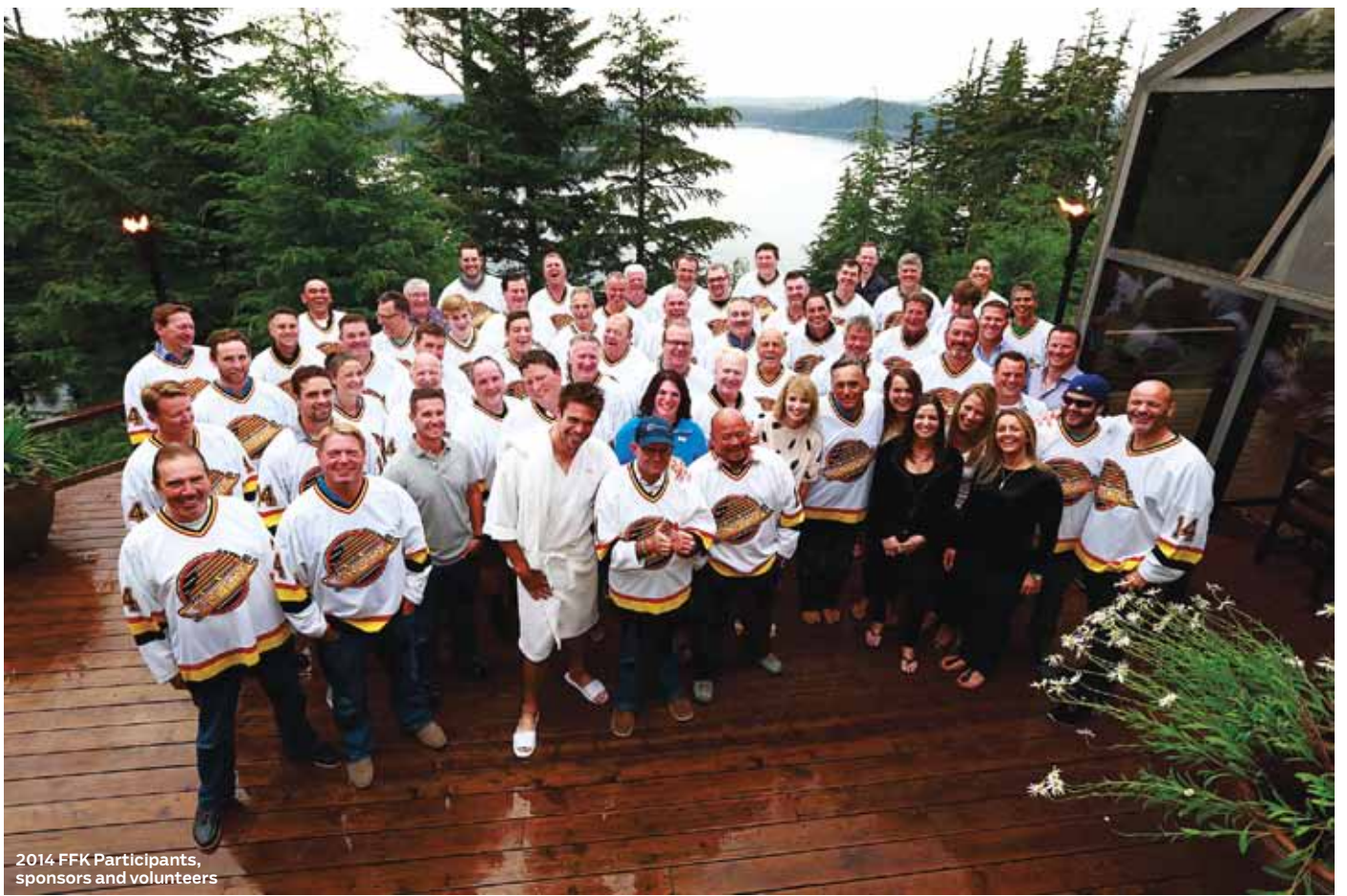
2014 FFK Participants, sponsors and volunteers