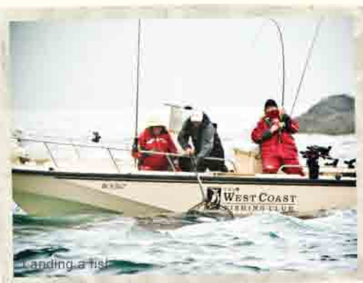
Landing a fish

For 2011, we hope to grow the tournament even further, enhancing the experience for our guests and generating even more funds for our worthy beneficiaries.