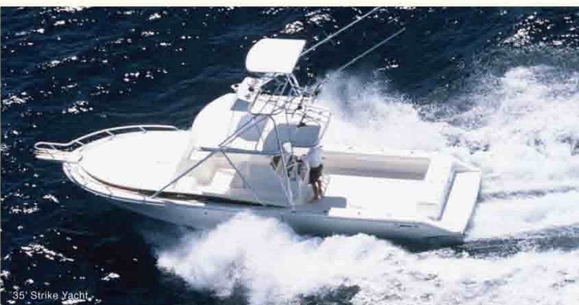
35' Strike Yacht

Our new fishing fleet will be comprised of a number of 35' Strike Yachts with twin 330 HP Cummings engines. These boats have proven to be excellent for coastal and offshore fishing ventures; the perfect vessel for our Panama lodge.