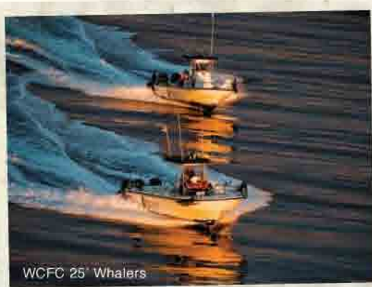
WCFC 25' Whalers