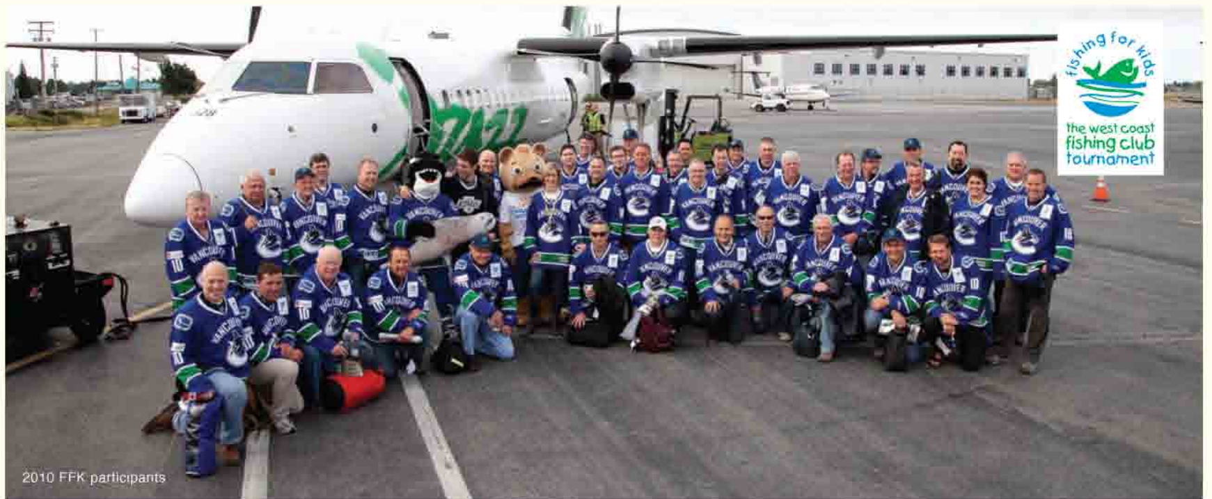
2010 FFK participants

F ishing for Kids Tournament brings together a group of 42 anglers in a unique networking and social environment at The Clubhouse, raising much-needed funds to help and support BC's most respected children's charities. This year, the fifth annual Fishing for Kids Charity Tournament proved to be another memorable weekend with NHL defenseman Willie Mitchell scooping the grand prize with his 47.3lb Chinook on the first morning. This year, the tournament raised $510,001 during the three-night trip – a huge thank you to everyone involved, especially to BC's mining industry, presenting sponsor SMS Equipment and to Jazz Airlines, Helijet and Sysco.