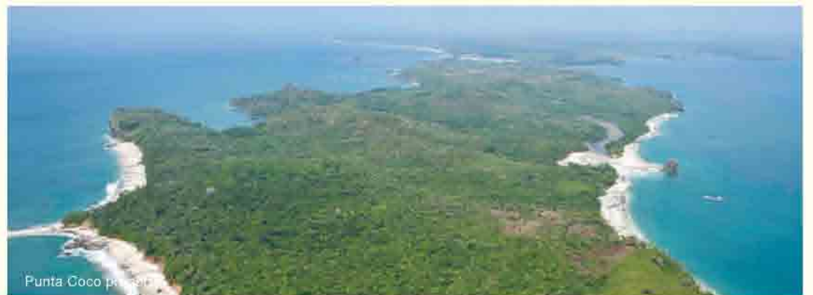
Punta Coco peninsula