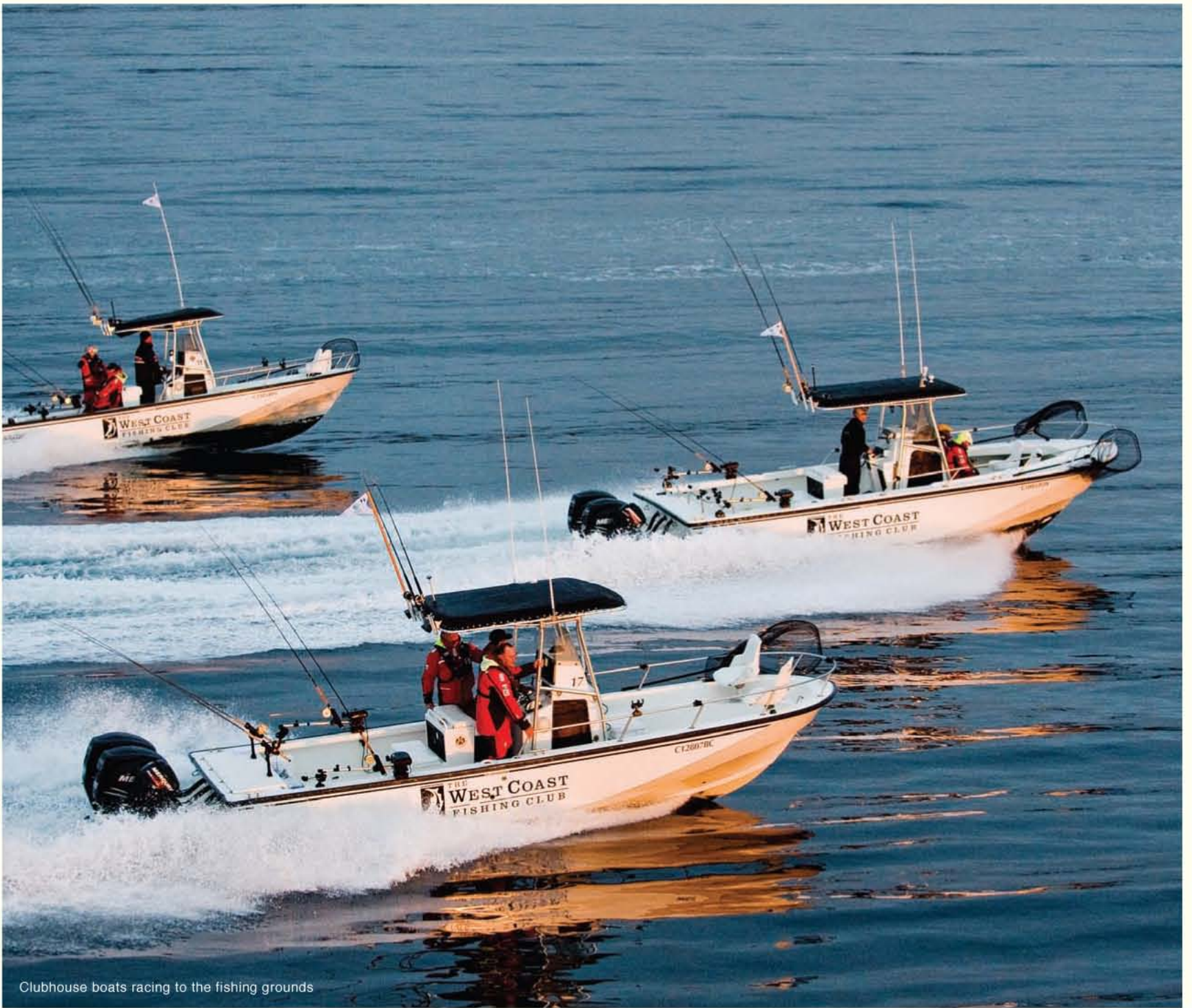
Clubhouse boats racing to the fishing grounds