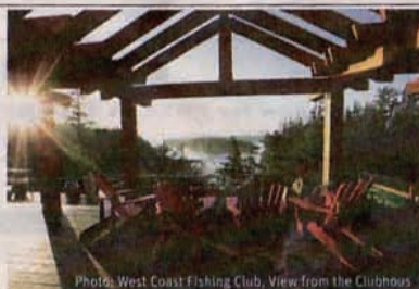
View from the Clubhouse