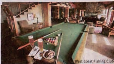
West Coast Fishing Club

fire, read a book or play a game of pool, it's your choice. And, following an exhilarating day pursuing the fish, or simply enjoying the area, a sound sleep will be yours. Guest rooms are thoughtfully appointed and quite frankly, there isn't anything the management and staff won't do for you.