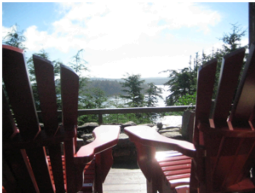
Soak in all the amenities at the West Coast Fishing Club

While the 2010 fishing season is over at West Coast Fishing Club , a resort and salmon fishing hotspot in Haida Gwaii—formerly the Queen Charlotte Islands—off the northern coast of British Columbia, anglers will want to make note of this five-star fishing experience. With top-of-the-line tackle and powerful Boston Whaler boats, not only is the Langara Island locale one of the best spots for salmon sport fishing, it also offers access to a Haida village (not unlike the heritage site in Gwaii Haanas National Park Reserve on the southern end of the archipelago), and a chance to see killer whales, sea lions, and eagles circling in their natural environment.