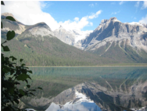
Emerald Lake in Canada's Yoho National Park

At Yoho National Park in British Columbia, the bears are stashing their holiday candy of berries and bugs in their tummies, to tide them over for a long winter's nap. I had the pleasure of visiting Cathedral Mountain Lodge , a rustic yet upscale lodge with 31 log cabins situated on the banks of the Kicking Horse River. I was there to watch the leaves change, look for wildlife in the Canadian Rockies, and enjoy the regional bounty of the area.